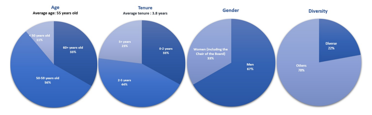
Identification and Evaluation of Nominees for Directors

The Nominating and Corporate Governance Committee utilizes a variety of methods for identifying and evaluating nominees for director. The Nominating and Corporate Governance Committee assesses the appropriate size of the Board of Directors, and whether any vacancies on the Board of Directors are expected due to retirement or otherwise. In the event that